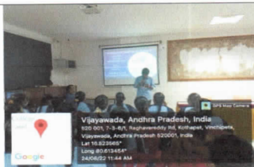
Student giving responding