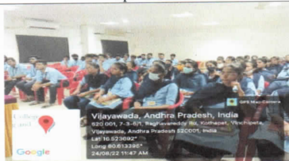
Students lisetening to the speaker lecture