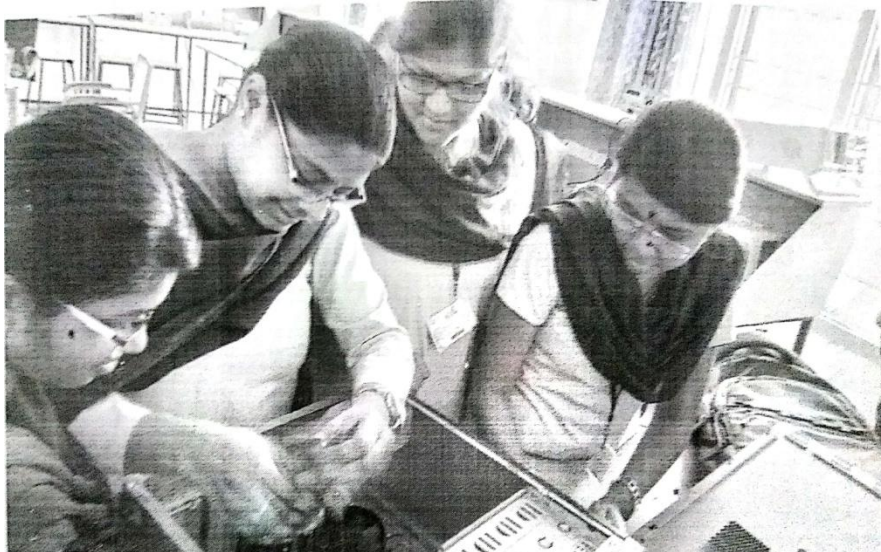
Fig: The Students are participated in Hardware Training class