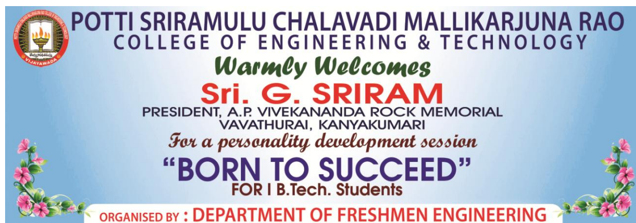
Fig: Banner for Seminar Born to Succeed