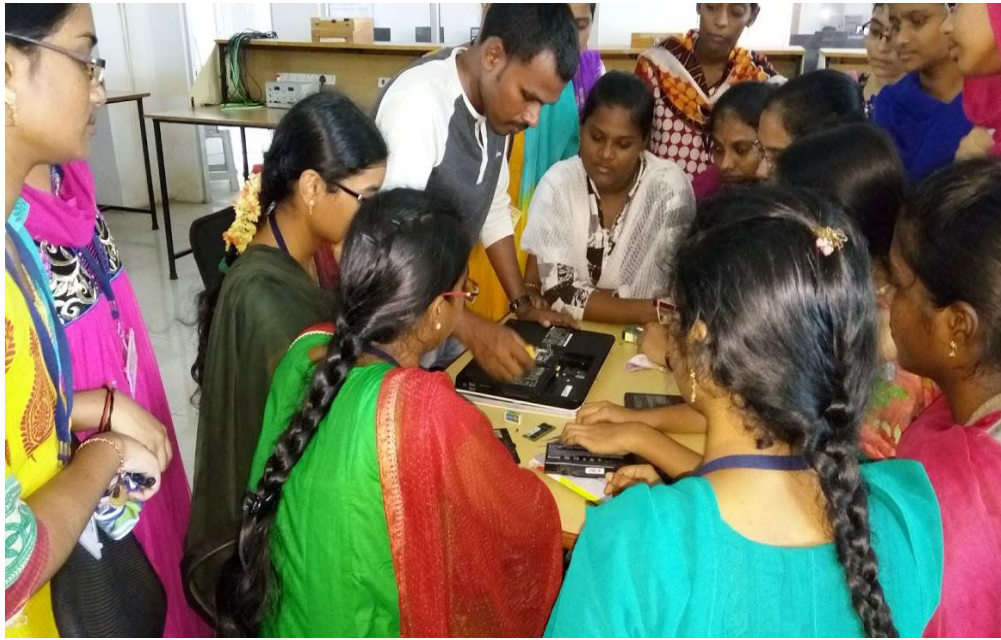
Fig: The trainer explaining about internal parts of computer