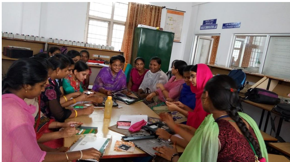
Fig. Students learning about the computer hardware