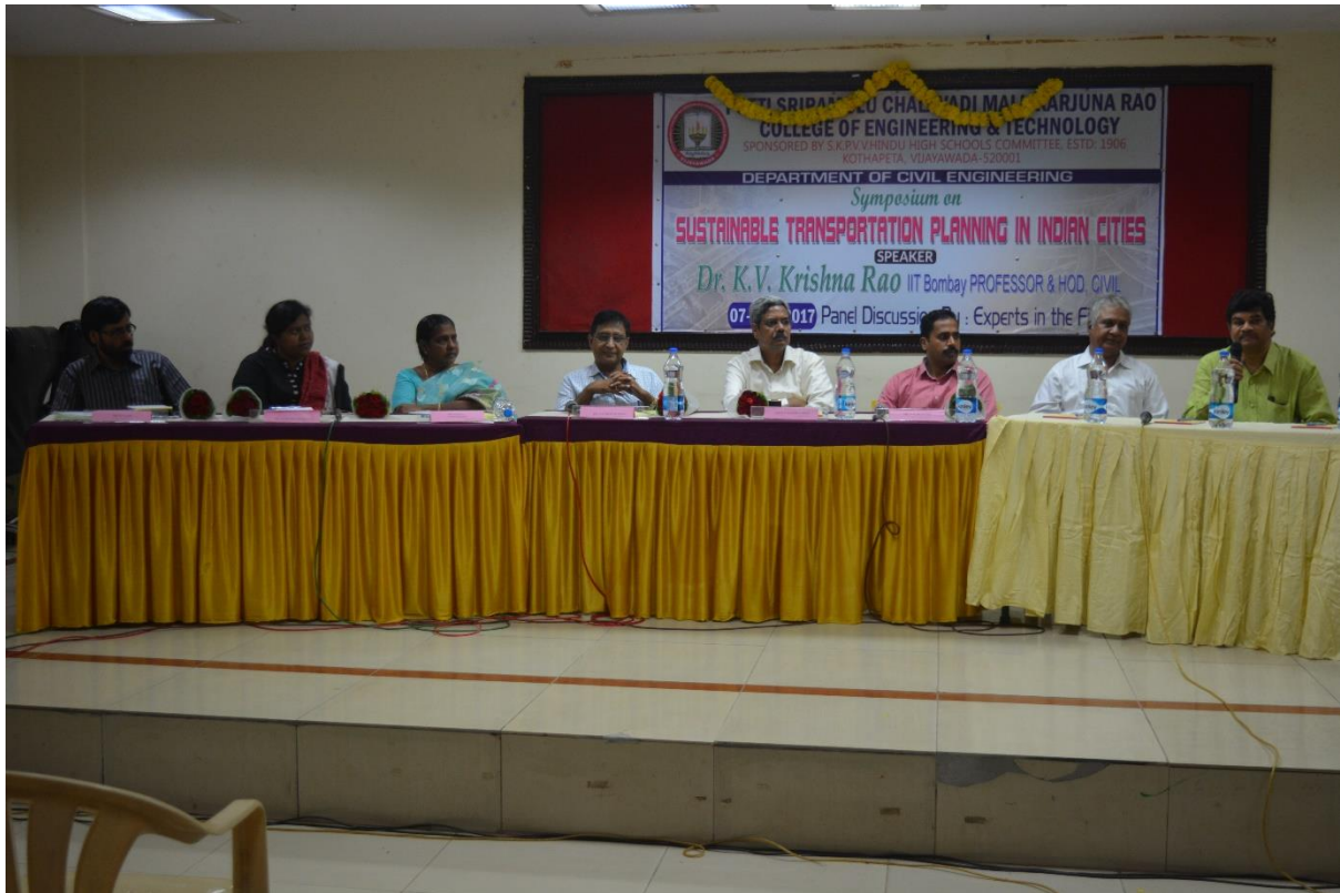
Figure1 Panel Discussion members