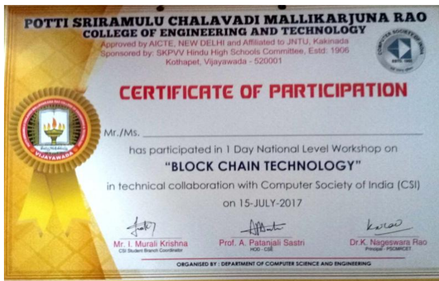
Fig: Certificate of Participation is distributed for Block Chain Technology