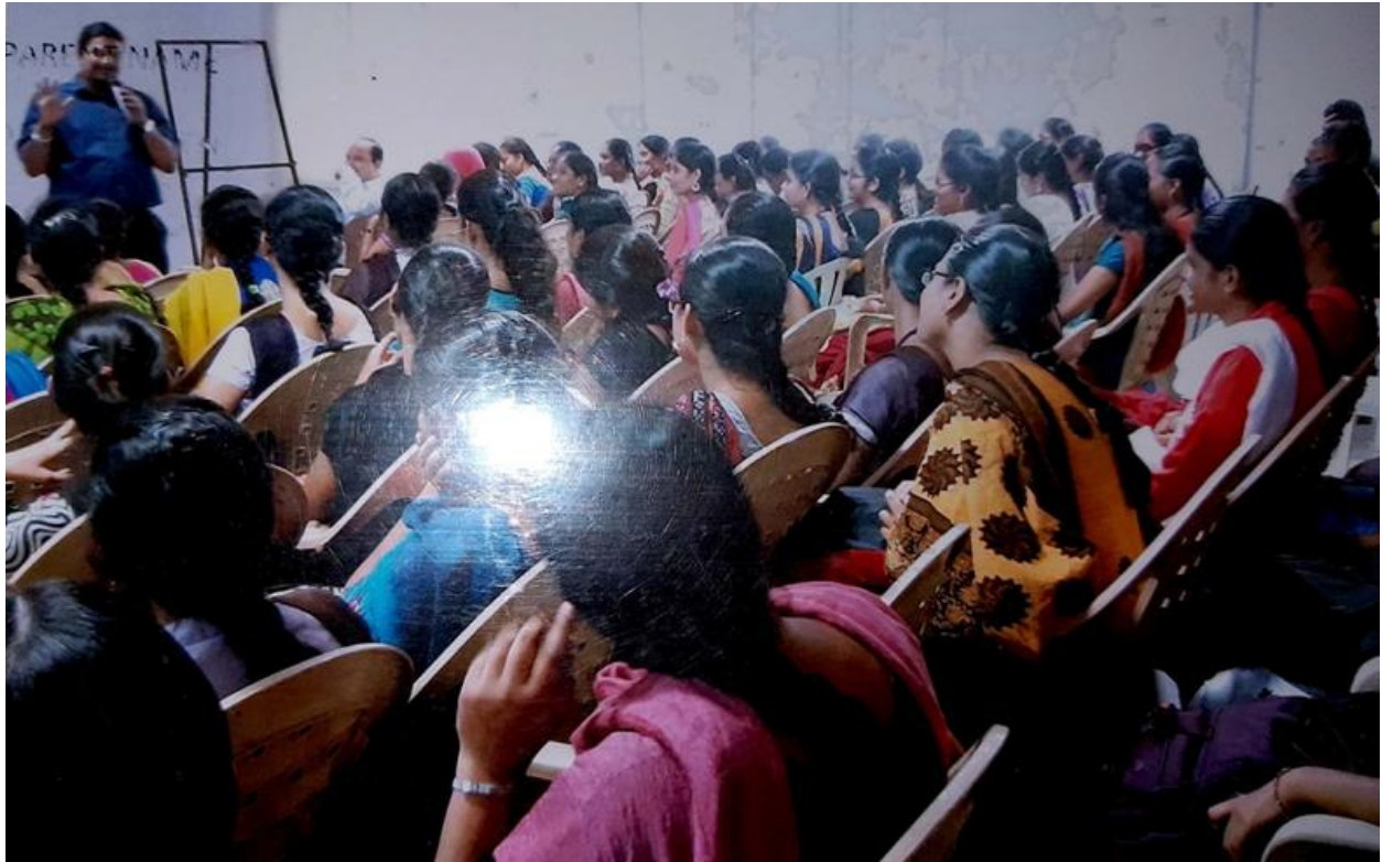
Fig: Resource person gave talk on Keeping Yourself At Least With Changing Technology

The " Keeping Yourself At Least With Changing Technology " Workshop is organized in the department of Computer Science and Engineering for all CSE students on the period 28-12-2017. The Resource Person share the useful stuff to the students. Around 100 students have registered for the workshop and utilize the opportunity.