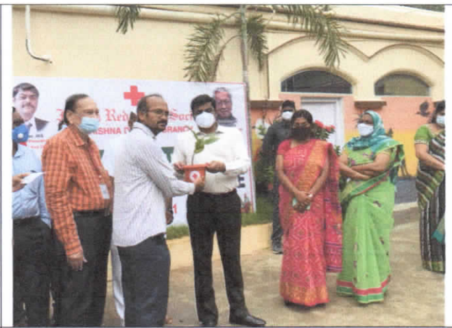
Distribution of saplings