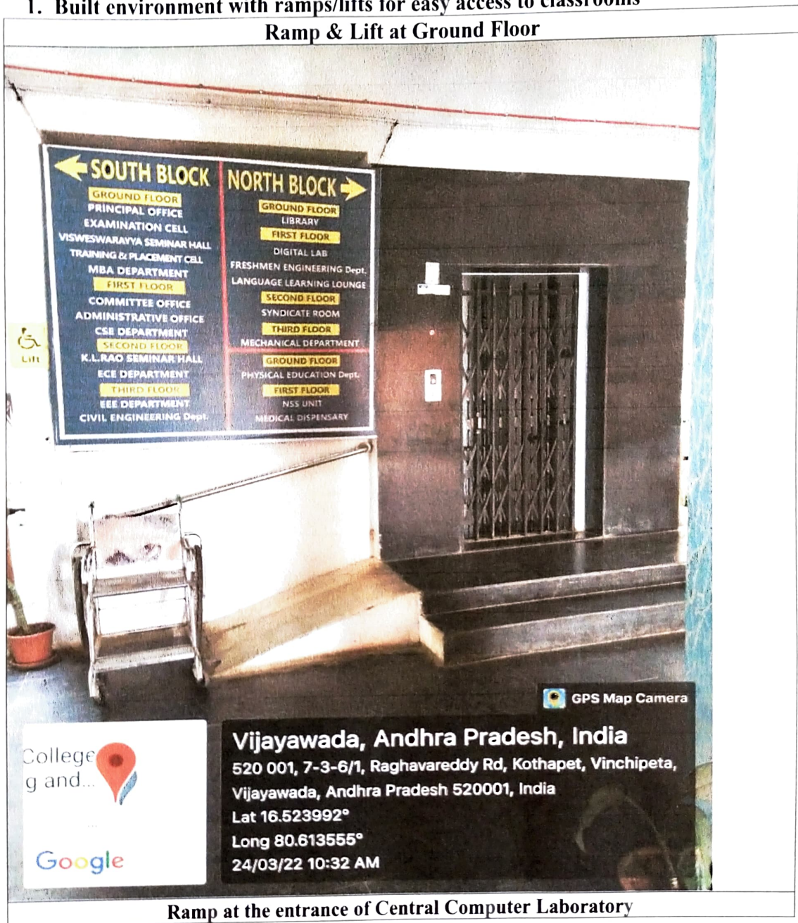
Ramp at the entrance of Central Computer Laboratory