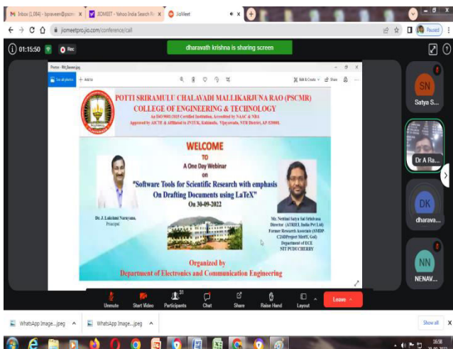
HOD Addressing the Resource Person