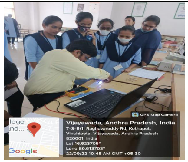
making a circuit connection