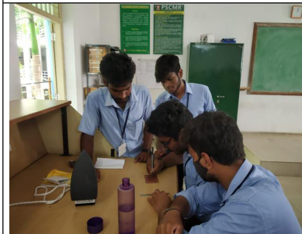
Student performing Drilling on PCB board