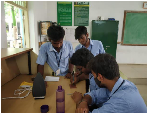
Student performing Drilling on PCB board