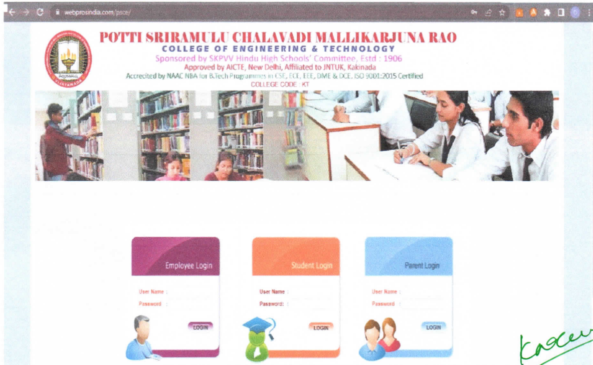
Student Admission and Support (E-Cap Interface)

PRINCIPAL Potti Sriramulu Chalavadi Mallikharjuna Rao College of Engineering & Technology Kothapet, VIJAYAWADA-520 001.