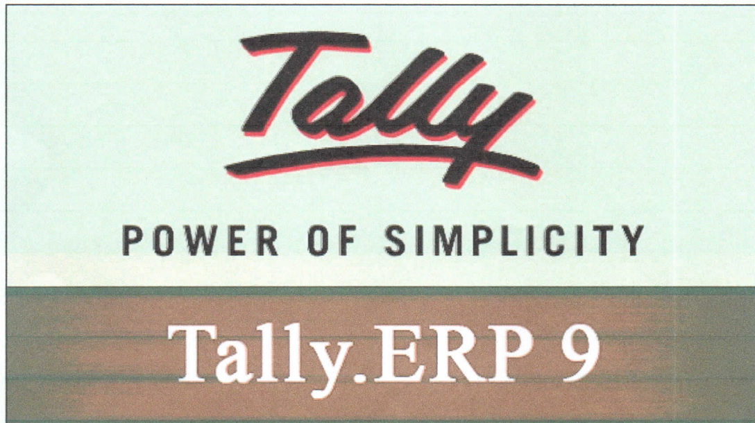
Screenshots of Finance and Accounts (Tally)